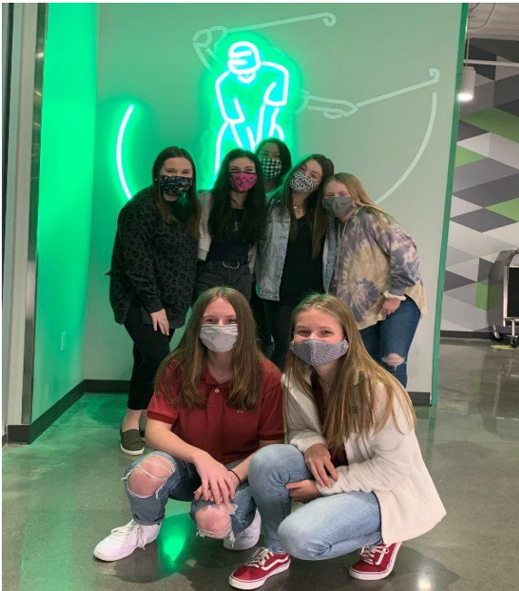
Youth Christmas Party at Drive Shack