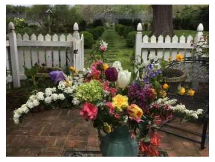
Happy Easter from Paul and Cheryl Vrooman, sharing flowers from their garden.