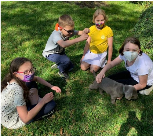
Children with Puppies at Kingdom Kids