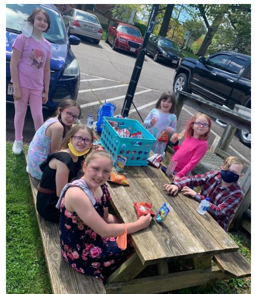
Children at Extended Session

Our May Memorial story starts with a gathering of Christians of different denominations meeting in the Courthouse, and after a few years of gathering a decision had to be made. The way I've heard the story is that it was a Methodist who made the motion that we be a Baptist Church, and so we were. But we have certainly kept that ecumenical flavor. It is in our DNA; it is a part of who we are. It is a unique quality, and it is another way that we can extend the welcoming hospitality that is a part of our church.