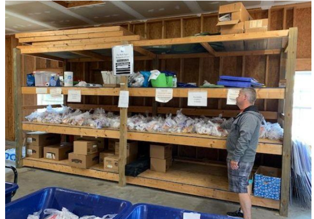
Above: May Memorial's Backpacks of Love Team.